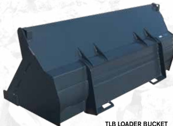
TLB LOADER BUCKET