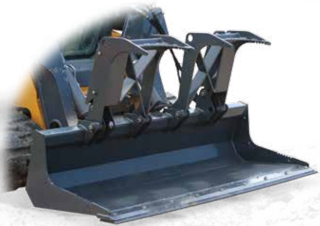
ALITEC SCRAP GRAPPLE