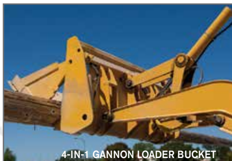
4-IN-1 GANNON LOADER BUCKET