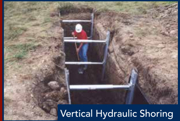
Vertical Hydraulic Shoring